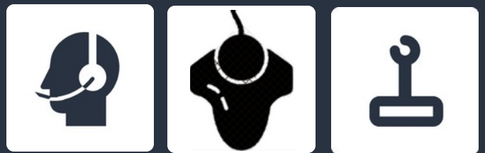
Sip-n-puff Track Ball Joystick

Can enable switch or pointer device control through accessibility features.